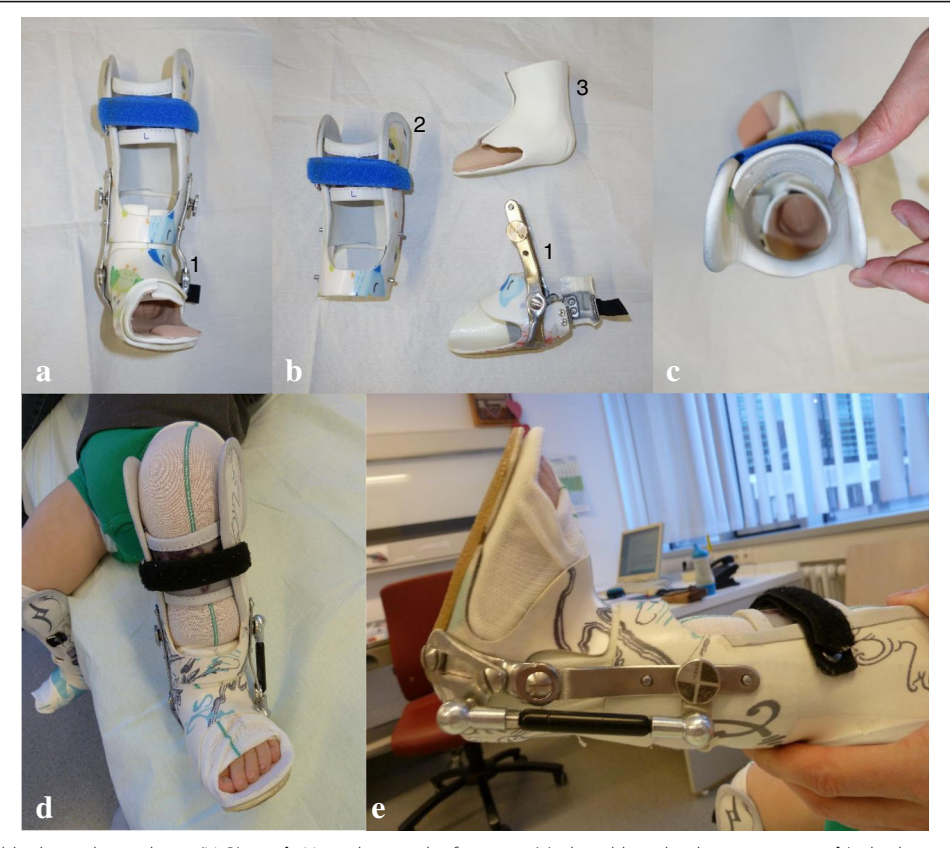
Fig. 2 a-e The Pohlig lower leg orthosis (LLO). a + b Note the circular foot unit (1) closed by a heel cap as seen in b ), the lower leg unit (2) and the inner liner made out of Tepefoam (3). The calcaneo-pedis block is held in 20° external rotation (see a and c ) and 20° dorsal extension (see e ). A mounted gas pressure spring to push into dorsal extension that can be adjusted, if desired, is also shown

plantarflexion/dorsiflexion. Rotational stability of the orthosis in relation to the axis of the knee is mandatory to maintain the position and therefore the correctional capacity of the foot unit. This is achieved by mounting the lower leg unit with a combination of ear-shaped supports encompassing the femoral condyles at the proximal ending of the lower leg unit, working as a counter bearing against the rotational forces. The range of motion of the knee joint is not limited by those encompasses. Further stability is provided by a firm intake of the calf, realized by a Velcro-fixed resin cap above the tibial tuberosity that provides an intake working like a Sarmiento brace (Fig. 2a-e).