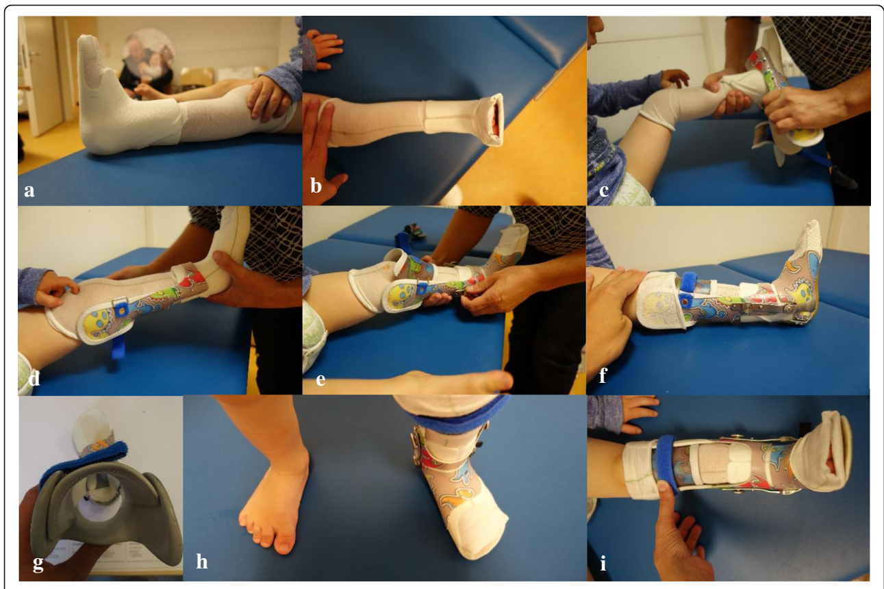
Fig. 3 a-i Putting-on of the Pohlig lower leg orthosis: ( \mathbf{a} + \mathbf{b} ) A stocking is put on the leg before the Inliner is applied, then the stocking is pulled over the Inliner ( \mathbf{c} + \mathbf{d} ) Now the lower leg unit is slipped over the foot and fixed to the shank ( \mathbf{e} ) The foot unit is slipped over the foot and fixed to the lower leg unit by screws. ( \mathbf{f} , \mathbf{h} , \mathbf{i} ) The mounted orthosis fixes the foot in neutral dorsiflexion and 20° of external rotation. Further 5–10° of dorsiflexion are allowed by hinges when walking in the orthosis ( \mathbf{g} ) Top view of the orthosis, demonstrating external rotation of the foot unit versus the lower leg unit