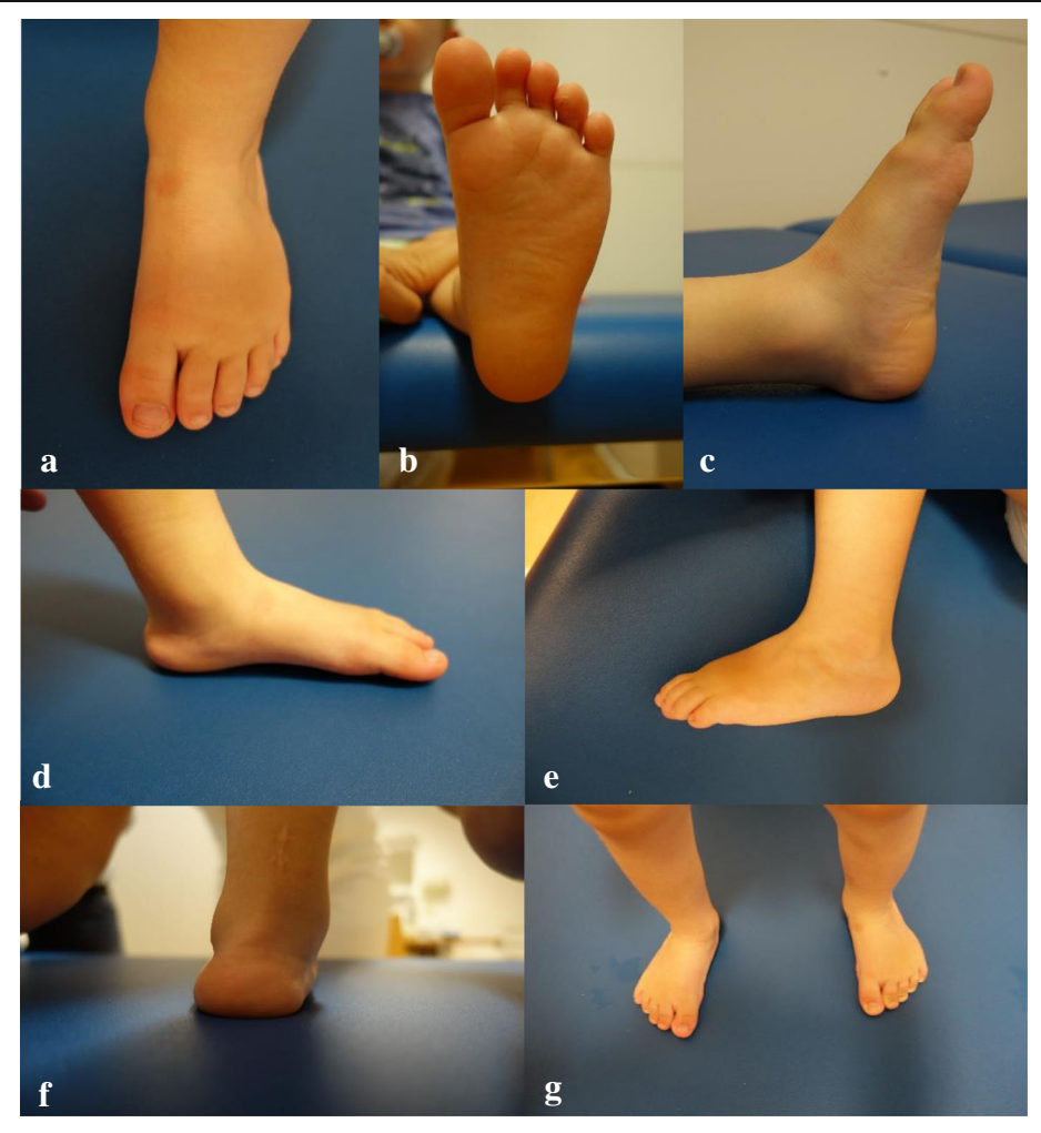
Fig. 5 a-g This otherwise healthy boy (same boy as in Fig. 2) presented at birth with a congenital vertical talus at the right foot and a congenital clubfoot at the left side (Pirani score 6, stiff-soft). His treatment with LLO started right after removing the last casts. At the time the photographs were taken, he was 2.5 years old. (a + b) There is only minimal adduction of the greater toe and neutral orientation of the left forefoot (c, d). The heel is in slight valgus position (f). Residual from his deformity is a pronounced internal rotation of the left tibia (g)