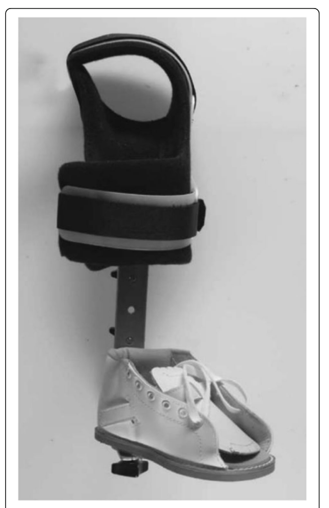
Fig. 7 The orthosis used by George et al. 2011, using a modular system [22]

In the classic orthotic AFO design as used by Janicki et al. [23] the foot is fixed into a dorsally applied shell by Velcro straps (Fig. 6). To our experience, a foot can move in a plastic half-tube shell to a certain amount around its axis, and supination of the foot is quite easily performed. In our design of the articulated lower leg orthosis the foot is held in a full-contact custom-made circular encompassing, preventing any undesired movement of the foot once the heel cap is closed. The