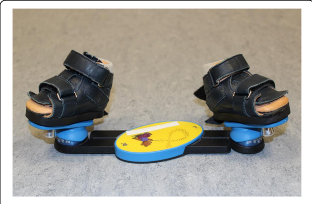
Fig. 1 The foot abduction brace (FAO)

At each visit, we asked the parents about difficulties in complying with the bracing protocol. If the brace or orthosis was not put on for 23 h during the first 3 months of life and for at least 10 h per night until the end of the third year of life, it was regarded as non-compliance, and the reasons given by the parents