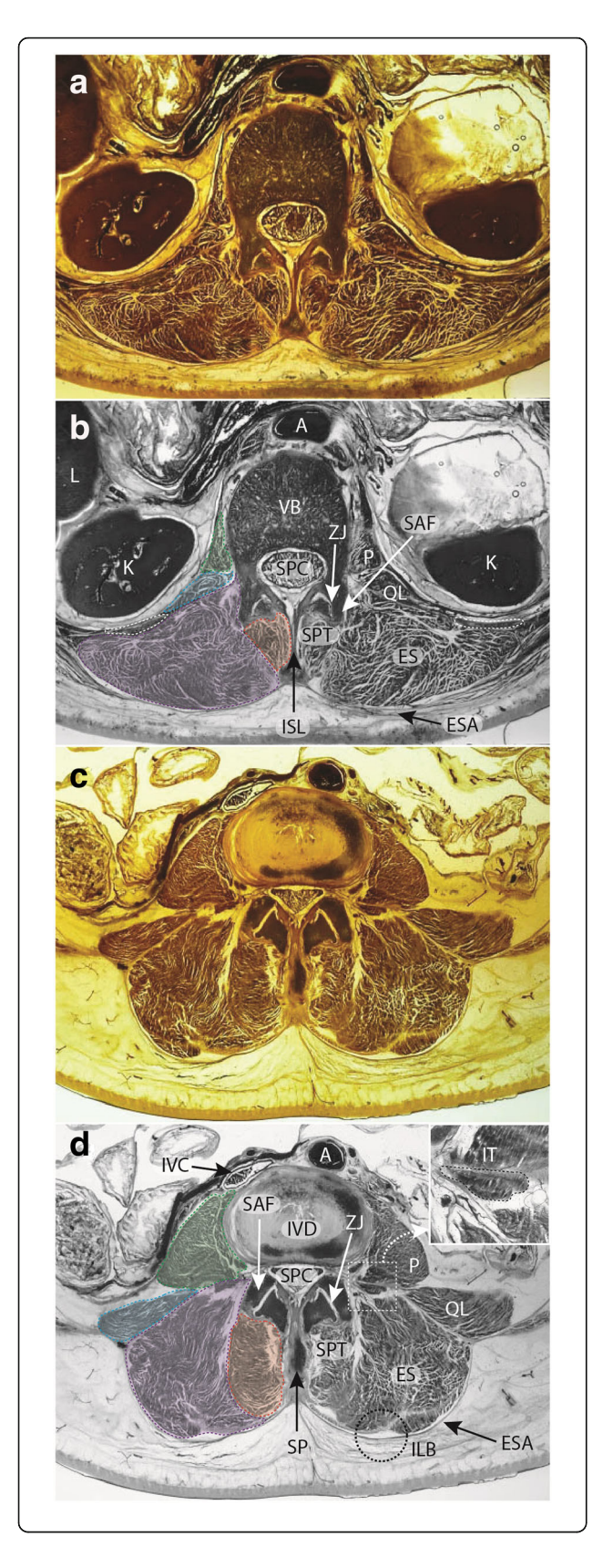
Fig. 1 Axial E12 plastinated sections ( a, c ) and schematic illustrations ( b, d ) at approximately L1 ( a, b ) and L4 ( c, d ) highlighting anatomical structures at these vertebral levels. b, d Dotted lines and shading, Green - psoas major muscle; Blue - quadratus lumborum muscle; Purple - erector spinae muscles; Red - spinotransverse muscles. b round white dotted regions (bilateral) denote 12th rib. d square dotted box surrounds enlarged inset; round dotted circle indicates morphological feature of interest (ILB fatty 'tent'). Legend : A - aorta; ES - erector spinae muscles; ESA - erector spinae aponeurosis; ILB - iliocostalis - longissimus boundary and indentation; ISL - interspinous ligament; IT - intertransversarii muscle; IVC - inferior vena cava; K - kidney; L - liver; P - psoas major muscle; QL - quadratus lumborum muscle; SAF - superior articular facet; SP - spinous process; SPC - spinal canal; SPT - spinotransverse muscle group; ZJ - zygapophysial joint

rotatores muscles, apparent in other spinal regions, do not exist in the lumbar spine [38].