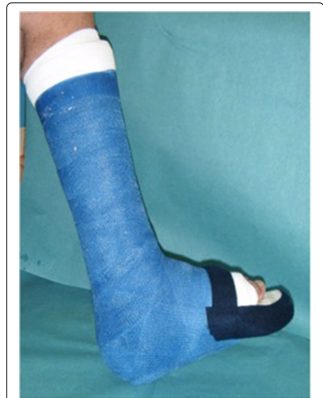
Fig. 1 Example of a total contact cast (TCC), consisting of a properly cushioned, custom-made, rigid, fiberglass boot

c Based on Sanders and Frykberg Anatomic Classification [26]