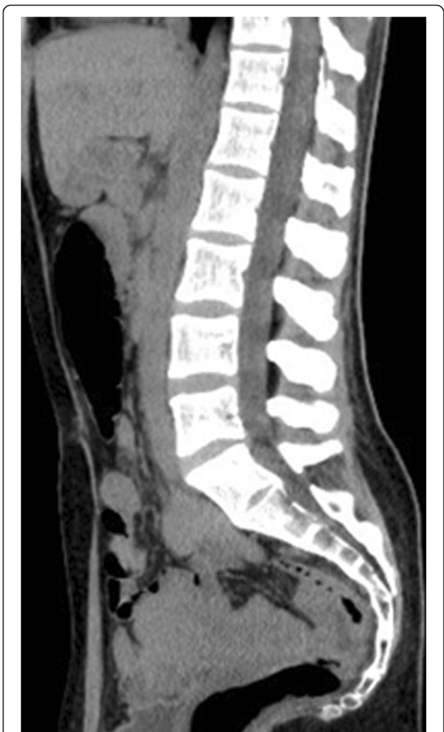
Fig. 1 Abdominal and pelvic sagittal computed tomography (CT) image on disease day 2. CT showed no abnormalities

had peaked from the first examination. Abdominal and pelvic CT performed on disease day 2 showed no abnormalities (Fig. 1). Spinal MRI, which greatly contributes to prompt diagnosis of acute purulent spondylitis and discitis in comparison to CT [2], was performed on disease day 7, and results suggested no signs of acute purulent spondylitis or discitis (Fig. 2). Her fever persisted at 38 °C or higher, but resolved on disease day 6. The low back pain would become particularly worse with movement. The pain made it difficult for the patient to get up, and hindered her daily life. However, the pain had mostly disappeared by disease day 8. Paired serum samples from disease days 4 and 15 exhibited a significant increase in coxsackievirus B3-neutralizing antibodies (Table 1). Based on this disease course, we diagnosed the patient as having epidemic myalgia. The patient made an uneventful recovery without any residual symptoms 6 months after this acute episode.