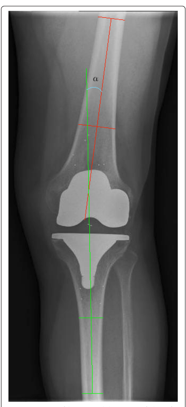
Fig. 1 Measurement of the anatomical alignment (a) of a knee after primary TKA with a Vanguard ROCC knee prosthesis as presented by Petersen et al

Each group of TKA's were then matched 1:2 to a population of patients receiving a previous generation