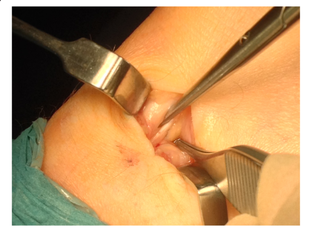
Fig. 1 Thickened plantaris tendon in close relationship to the medial Achilles tendon found during surgical exploration

There was medial activity-related tendon pain in 20/23 tendons. Three patients had medial and lateral activity-related tendon pain. There was tenderness on the medial side of the tendon in 20/23 tendons. In 3/20 tendons, there was medial and lateral tendon tenderness.