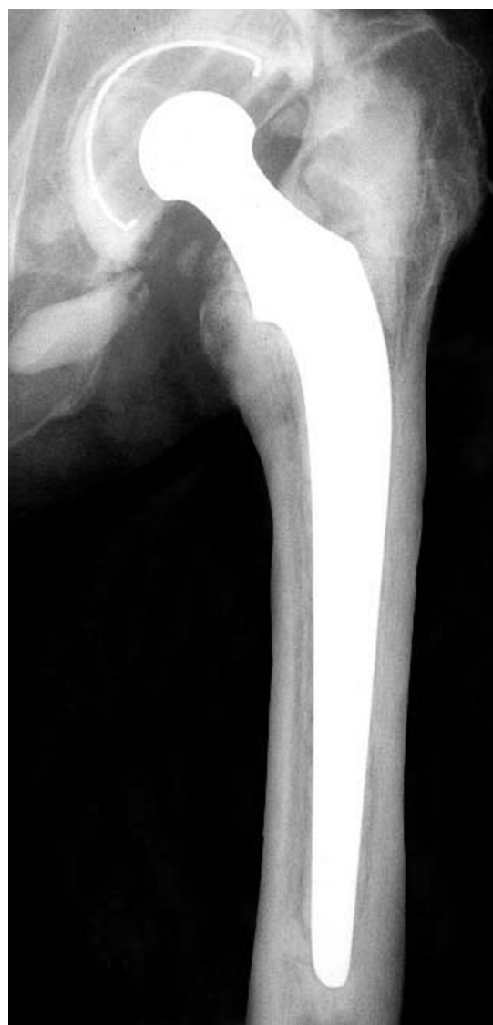
Figure 4 Stem loosening in a Charnley arthroplasty (17 years follow-up).

To sum up, our study seems to confirm a higher frequency of early complications and a higher assessment rate of the THA in general hospitals compared to those in dedicated centres, although in the long term this trend does not keep up and the survival rates become similar. LFA undertaken