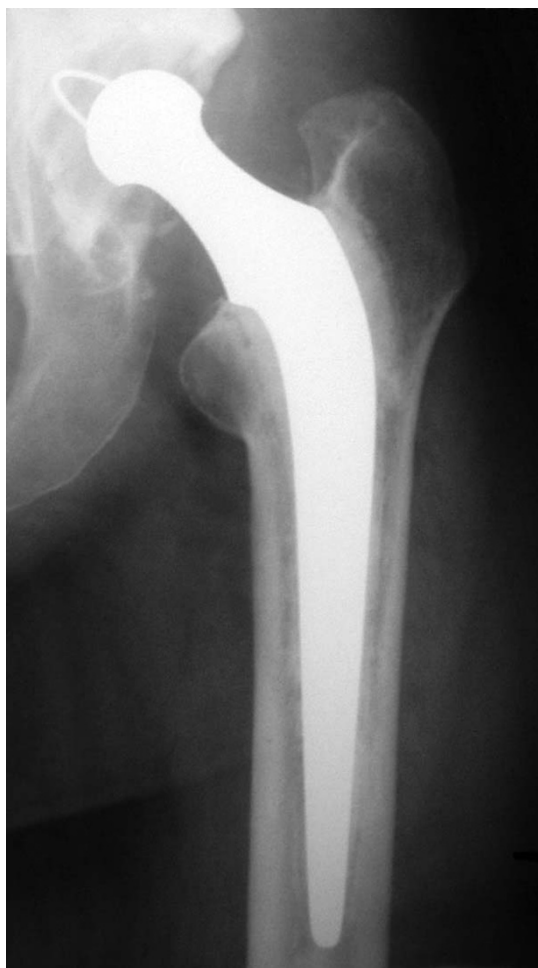
Figure 1 Low friction arthroplasty with 22 years follow-up. No complications.

404 LFA (294 patients) performed as primary procedures consecutively from 1976 to 1993 have been included in this study. In all cases the implant used was the prosthesis designed by J. Charnley, with the technical and design improvements added throughout the years [9]. The surgical procedures were undertaken by a team of six general orthopaedic surgeons following a homogeneous technique, always using a Smith-Petersen anterior approach without performing the osteotomy of the greater trochanter. The senior surgeon (DHV) had previously attended to the Center for Hip Surgery at Wrightington,