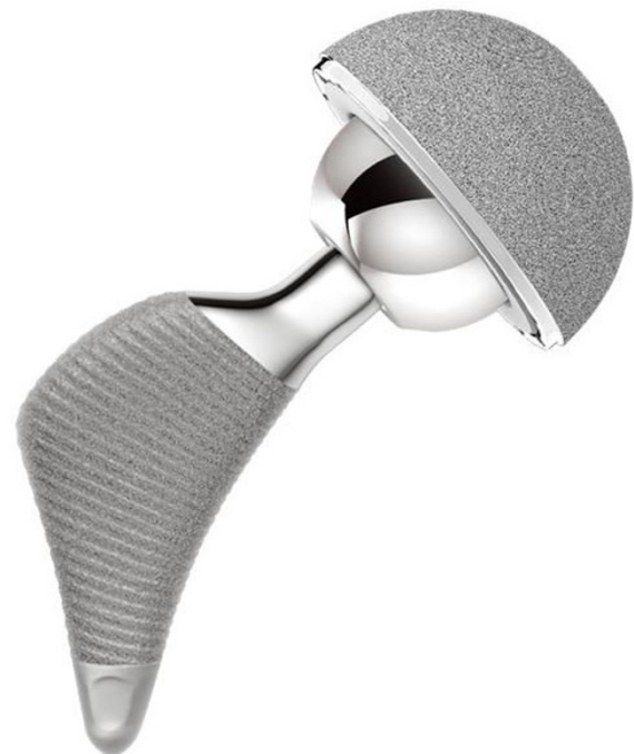
Figure 2 The DePuy Proxima™ hip.

The DePuy Proxima™ hip (DePuy International, Leeds, UK) is manufactured from titanium alloy (Ti-6AL-4V) and has a lateral flare intended to conform to the lateral femoral endosteal surface (Fig. 2). The stem has a 12/14 taper and is available in high and standard offsets. The physiological neck angle is set at 130° and the prosthesis is anatomically shaped with an anteverted neck and available in left and right versions. The entire proximal region of the stem has a sintered bead porous coating with a thin layer