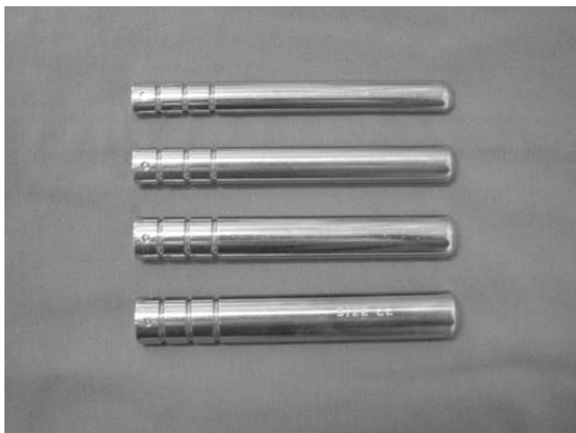
Figure 3 Metallic bars made mimicking the fibular shape were used for trials. There are 4 sizes: 12, 14, 16, 18 mm in width.