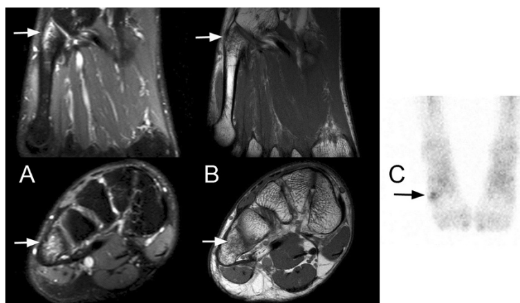
Figure 1 Case of a high-risk, low-grade stress fracture Case of a 22-year-old male handball player with pain over the proximal fifth metatarsal bone. A) shows bone marrow edema in T2-weighted MRI images in the transverse and coronal plane at the base of MT V. B) represents the corresponding T1-weighted images. The seemingly hypointense area indicated by the arrow was rated negative for bone marrow edema, showing no different signal intensity compared to the other metacarpal bases (not shown in displayed images). The anterior view of the osseous phase of bone scintigraphy C) shows a poorly defined area of increased uptake consistent with a low-grade injury. In accordance with our grading system (Table 1), this case was rated a low-grade stress injury at a high-risk site (Table 2) by the adjudication panel. The return-to-sports-time was recorded after 82 days.

All tests were two-sided and a P value lower than 0.05 was referred to as significant.