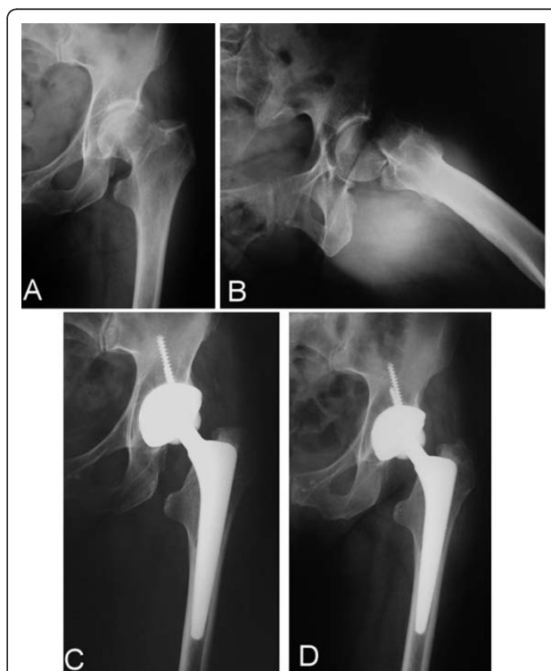
Figure 2 cementless THA preoperatively (A-B), at 1 (C) and 4 (D) years postoperatively.

The strong point of this work is that it demonstrates that the use of alumina-on-alumina implants for total hip replacement yields satisfactory results in the medium term in young patients with no co-morbidities and