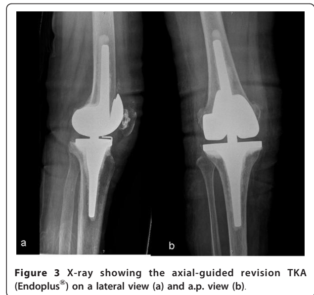
Figure 3 X-ray showing the axial-guided revision TKA (Endoplus®) on a lateral view (a) and a.p. view (b).

During the study period there was only one complication. A female patient with osteoporosis developed a supracondylar fracture during MUA. In this case, a change to a femoral revision implant was necessary (Figure 2a/b & Figure 3a/b).