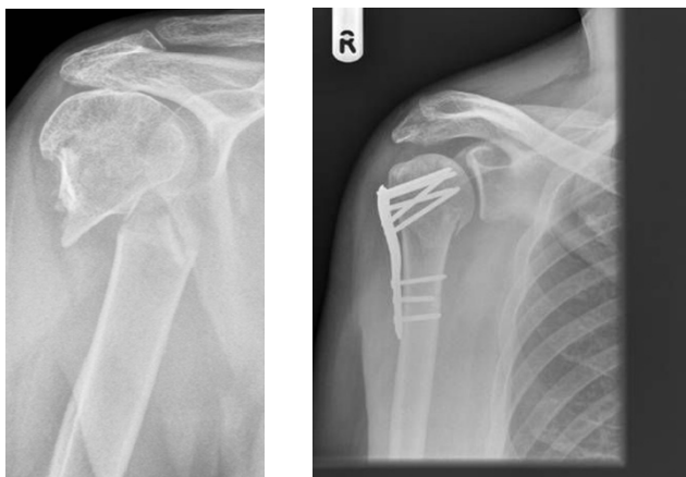
Figure 2 Two-part fracture of the surgical neck with subsequent internal fixation.