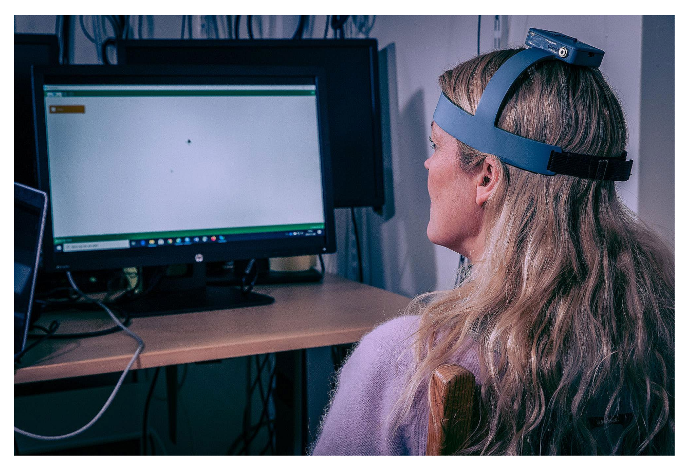
Fig. 2 Experimental set-up. (The photo is published with consent from the woman on the photo (the woman is the last author)

test trial was performed to familiarize participants with the test procedures.