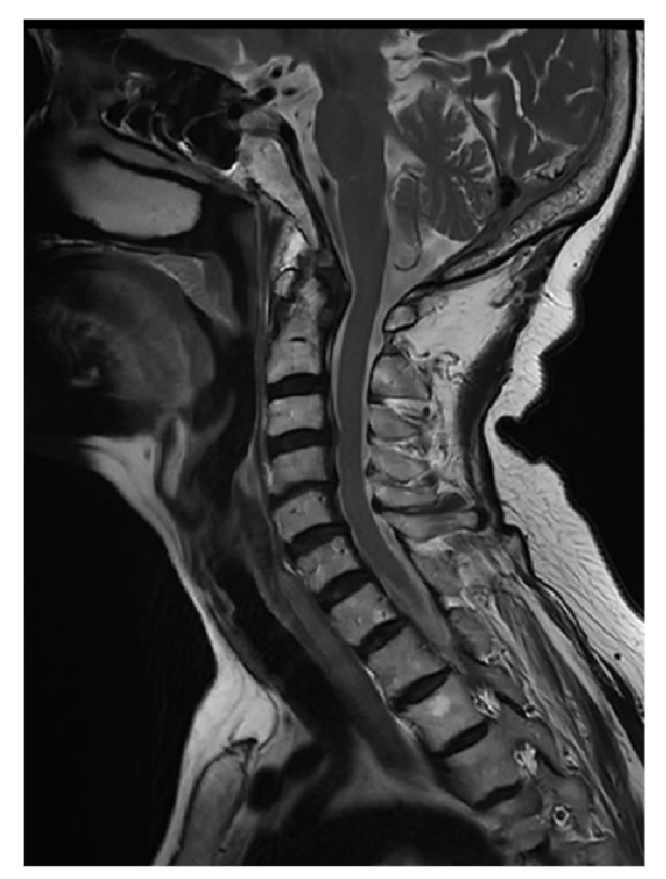
Fig. 4 Sagittal MRI of cervical spine

surrounding synovium thickened obviously, especially on the right side. The enhanced scan showed patchy enhancement of the synovium of the shoulder joint on both sides, and patchy enhancement of the adjacent bone