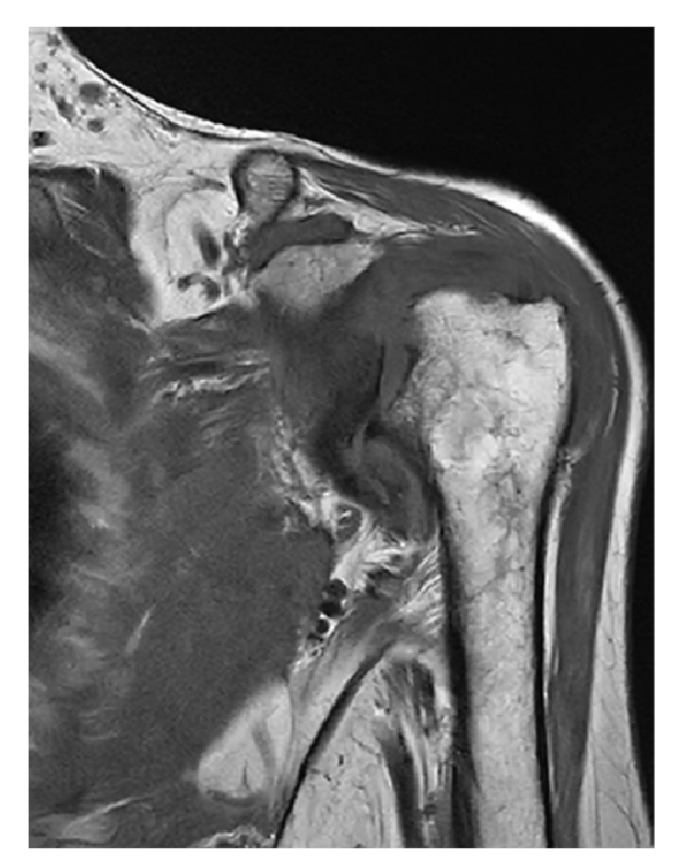
Fig. 1 Coronal MRI of the left shoulder joint

test: anti-cyclic citrullinated peptide antibody (A-CCP) 33.10U/ml (normal range: 0-5RU/ml); antinuclear antibody quantification (ANA) 47.40AU/ml(normal range: Negative or < 32); anti-double stranded DNA IgG antibody quantification (dsDNA) 31.00 IU/ml (normal range: 0-100 IU/ml); treponema pallidum antibody was negative; D-Dimer 6.43 µg/ml (normal range: 0-500ug/L); erythrocyte sedimentation rate (ESR) was 27 mm/h (normal range: <20 mm/h). C-reactive protein (CRP) 39.06 mg/L(0.068-8 mg/L). There are no abnormalities found in thyroid function, blood calcium and phosphorus levels, routine urine tests, and the parathyroid ultrasound did not reveal any abnormalities in the parathyroid glands. Anteroposterior X-ray of shoulder joint: hyperplasia and hardening of bone at the edge of shoulder joint, narrowing of shoulder joint space. Figures 1, 2 and 3 MRI 3.0 T enhancement of bilateral shoulder joints showed: the correspondence between the shoulder joints on both sides was unstable, the joint space was different in thickness and narrowness, the bone collapse and defect of the medial humerus head on both sides, the glenoid lip was unclear, and the surrounding bone edema presented long T1 and T2 abnormal signal shadows. There was thickening and swelling of the bursae of the shoulder joint capsule on both sides. There was a lot of fluid accumulation in the joint cavity, and the