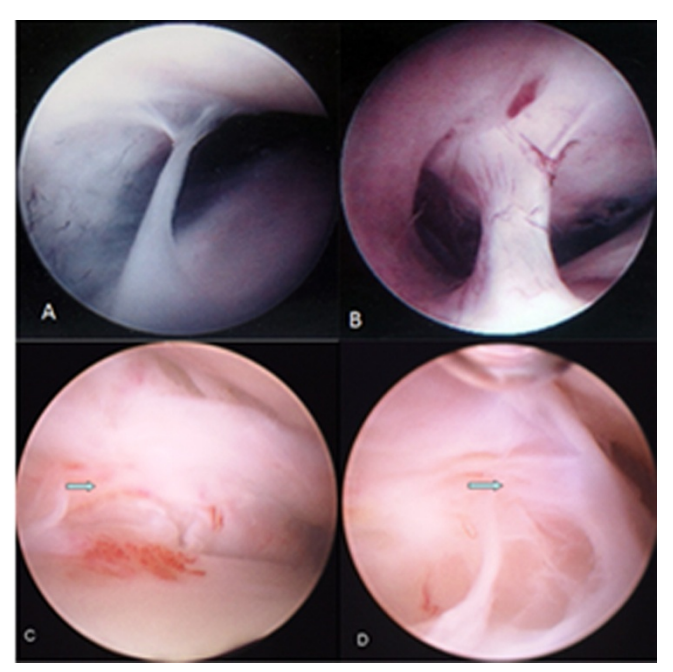
Figure I Different adhesions under arthroscopy. A. Arthroscopic view of grade I adhesion; B. Arthroscopic view of grade 2 adhesion; C. Arthroscopic view of grade 3 adhesion; D. Arthroscopic view of grade 4 adhesion.

silk-like adhesion connecting the intersynovial structures from the roof to the bottom structure. This pathology was observed both in the anterior and the posterior synovial pouch or recess, and usually in the medial capsular area (Figure 1A). Grade 2 was commonly observed in the anterolateral aspect of the upper joint compartment. As this broad adhesion is frequently formed at the anterior boundaries of the upper joint compartment, distinguishing the real capsule from this structure is not easy. Under precise and appropriate observation and palpation in the anterior recess, the adhesion surface with irregular distribution of capillary networks was revealed (Figure 1B). Grade 3 was defined as band-like adhesion connecting the glenoid fossa and the posterior disc band. It was usually detected in the intermediate space between the articular eminence and the articular disc or the posterior attachment. It could lead to moderate mouth-opening limitation (Figure 1C). Grade 4 is defined as an extensive adhesion, being formed in more than 3 parts of the joint compartment. This type of adhesion could also lead to severe mouth-opening limitation (Figure 1D). After operation, the shape, position and degree of adhesions were recorded by the assistant according to their coincident opinions with the disk being divided into nine parts [13].