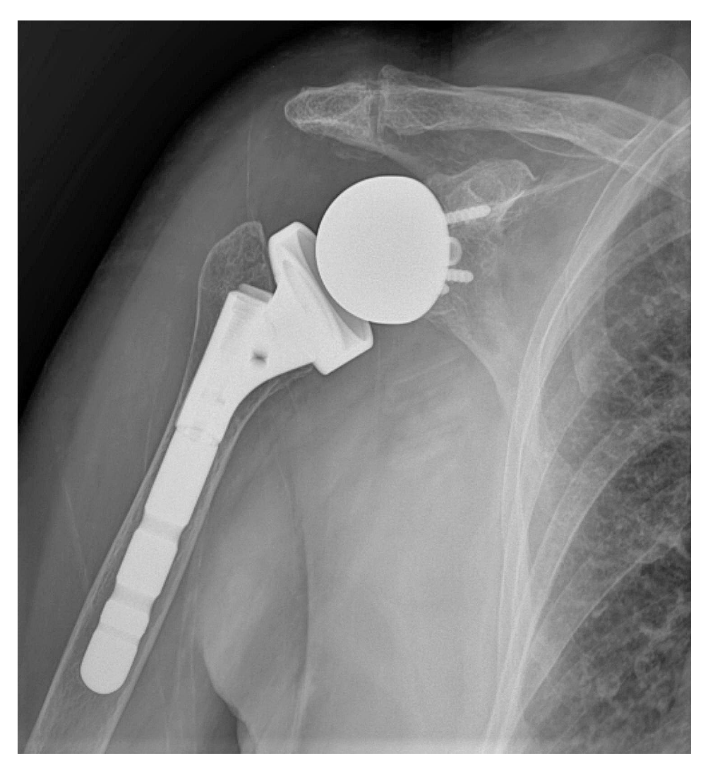
Fig. 2c 1st-year post-operative x-ray