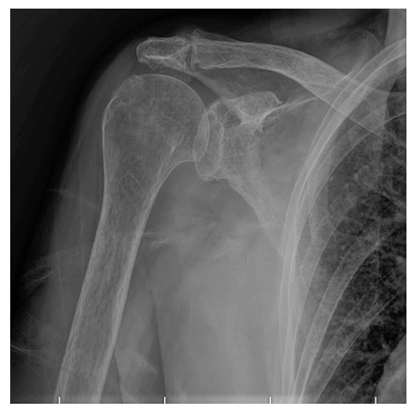
Fig. 2b Pre-operative X-ray

contrast, in the 1st-year evaluation, a negative weak correlation (r=-0.335, p<0.001) was detected (Table 4).