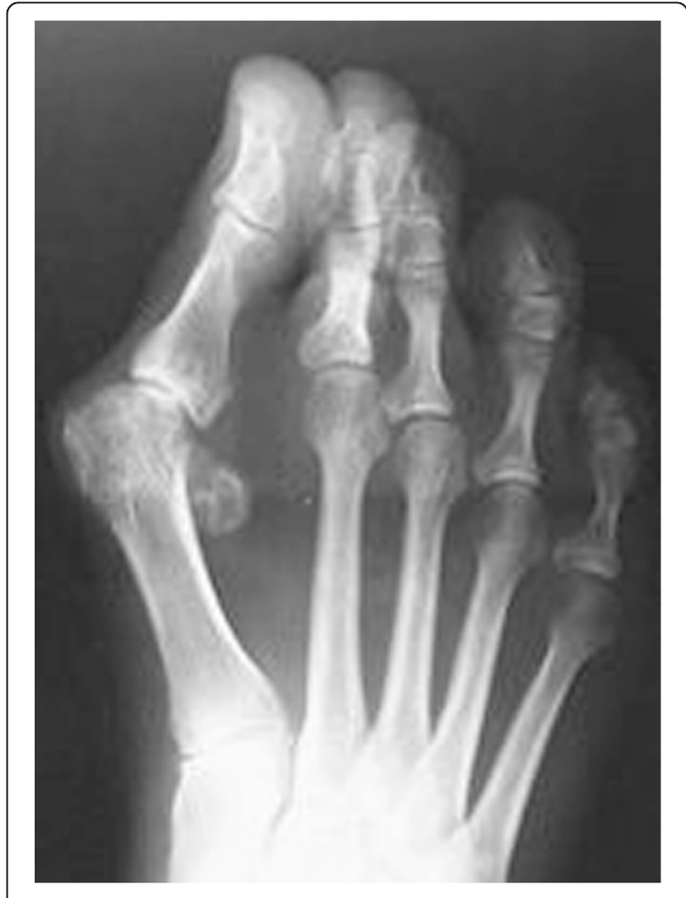
Fig. 2 Survey Case 2: Dorsoplantar weight-bearing radiograph of a patient's right foot. Complaints related to her hallux valgus deformity lasting since 2 years. She favours surgical treatment as conservative measures had failed

participant of the survey: number of surgical cases on the foot and ankle treated per year; most commonly used language (German, French, Italian, English); principal Swiss region of medical training (primary German speaking-, French speaking-, Italian speaking region or combinations thereof); type of institution of practice (University hospital; public hospital; private practice or mix of private and public); age and membership in the SFAS (Swiss Foot and Ankle Society).