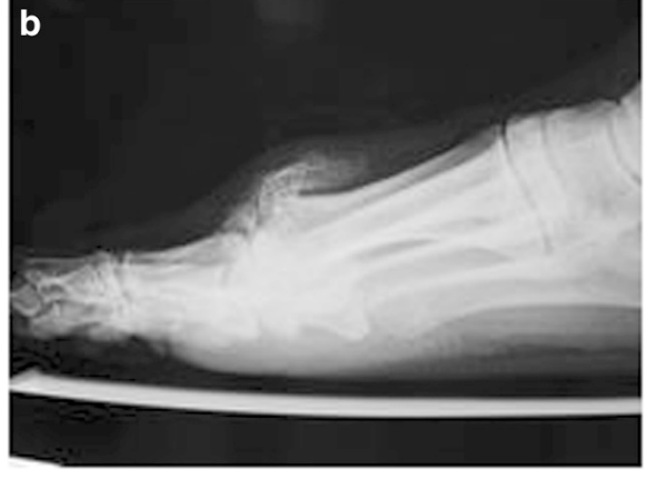
Fig. 3 a, b Survey Case 3: Oblique and lateral views of a patients left foot. Painful hallux rigidus since one year. Conservative measures have failed and the patients seeks surgical treatment