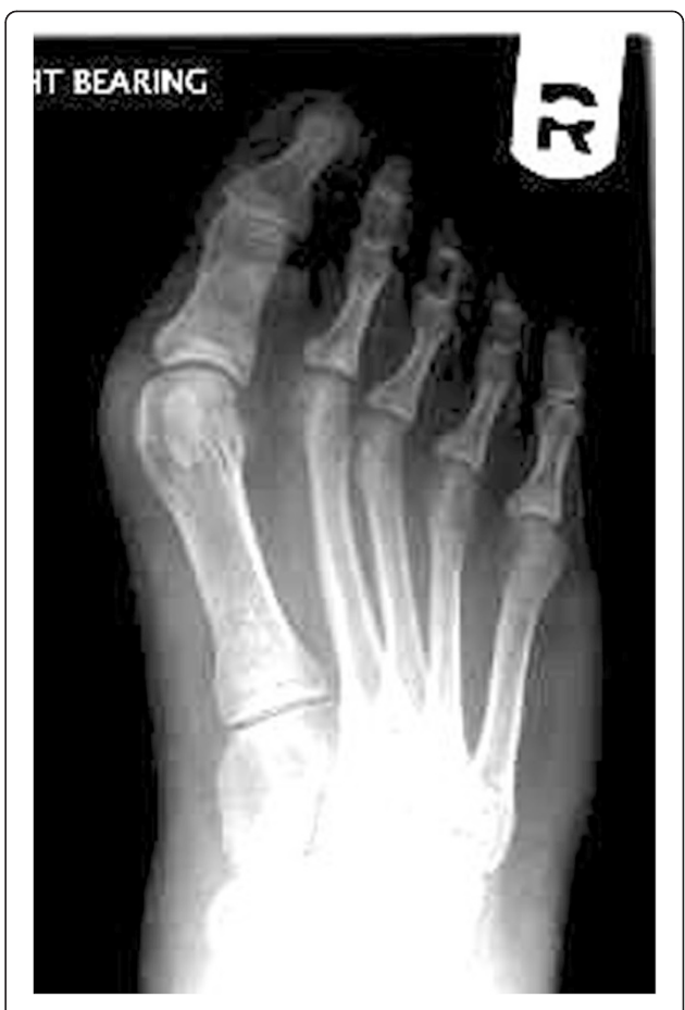
Fig. 1 Survey case 1: Dorsoplantar weight-bearing radiograph of a patient's right foot. History of complaints related to her hallux valgus deformity since one year, seeking surgical treatment after conservative measures had failed

Case 1 (Fig. 1) described a patient with a moderate hallux valgus deformity (hallux valgus angle 34°;