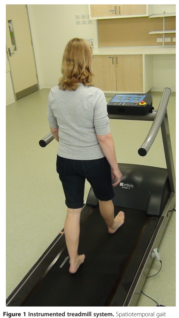
parameters and ground reaction forces were estimated using an instrumented treadmill system that incorporated a capacitance– based pressure array consisting of 7,168 transducers with a spatial resolution of 0.85 cm.

parameters is typically lowest at self-selected gait speeds [20], participants were instructed to set a comfortable walking pace for each testing session, but were blinded to the selected treadmill speed.