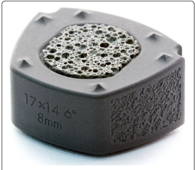
Figure 1 Valeo C+CSC cervical interbody fusion device.

Recently, ceramic materials have been evaluated as alternatives for interbody fusion devices. The cortical ring of the new device is manufactured by study sponsor Amedica Corporation (Salt Lake City, Utah) from its proprietary "MC<sup>2</sup>" silicon nitride (Si<sub>3</sub>N<sub>4</sub>) ceramic. MC<sup>2</sup> silicon nitride ceramic is a hydrophilic negative charged ceramic, which means that fluid (blood with nutrients) and proteins attach to the material, facilitating bone cell adherence and incorporation of the material in the surrounding bone. Cancellous Structured Ceramic (CSC) is a porous version of the same MC<sup>2</sup> silicon nitride ceramic (Figure 1). Therefore, the entirety of this device is manufactured from identical material. The CSC material