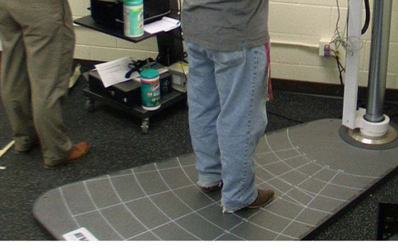
Figure 2 Shoulder height push assessment using BTE EvalTech system.

Subjects will be allocated to one of the three arms. Each treatment arm will have identical numbers of visits and contact time. Each arm will receive the uniform instructions for using of their assigned electrotherapy device. Patients will be instructed to use their assigned device daily upon waking and before bedtime, and up to two additional treatments during the day as needed (e.g., 4 1-hour treatment sessions). Providers will place electrodes and