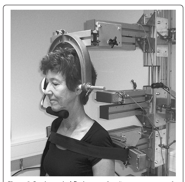
Figure 3 Cranio-cervical flexion test. Standing measurements of isometric cranio-cervical flexion strength, maximal voluntary contraction, and endurance 50% of maximal voluntary contraction (with permission).

pressure pain test is performed distally of the left arm lateral epicondylia. Thereafter, the following measures are made: Right and left upper trapezius muscle, in the middle between processus spinosus of C7 and acromion, and a reference PPT in the tibialis anterior muscle of each leg. Three measurements are made on each spot, alternating between right and left side. The PPTs of the trapezius muscles are part of the decision model for treatment (see Table 2 and Treatment components above) as well as a secondary